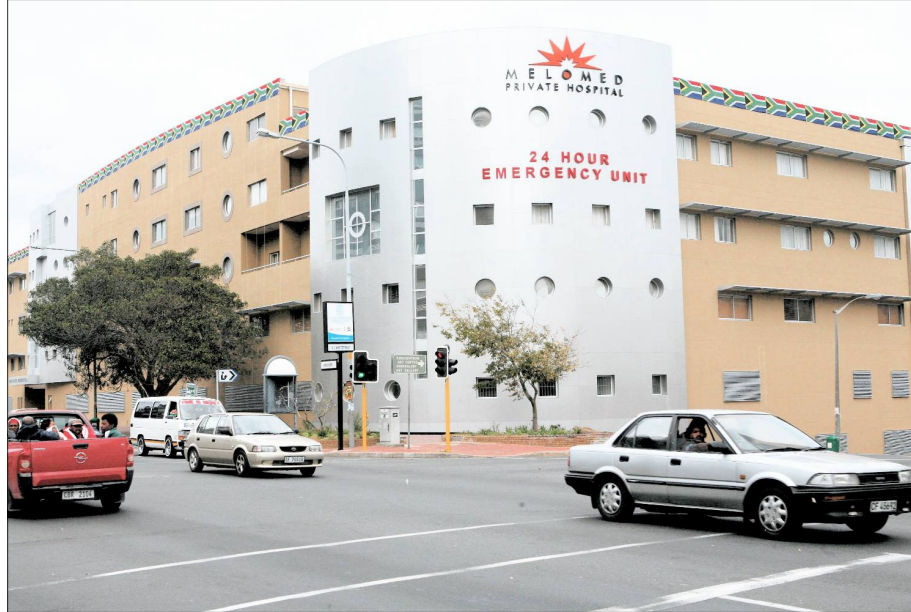
CONGRATS: New kid on the block – Melomed Bellville celebrates 1st anniversary.