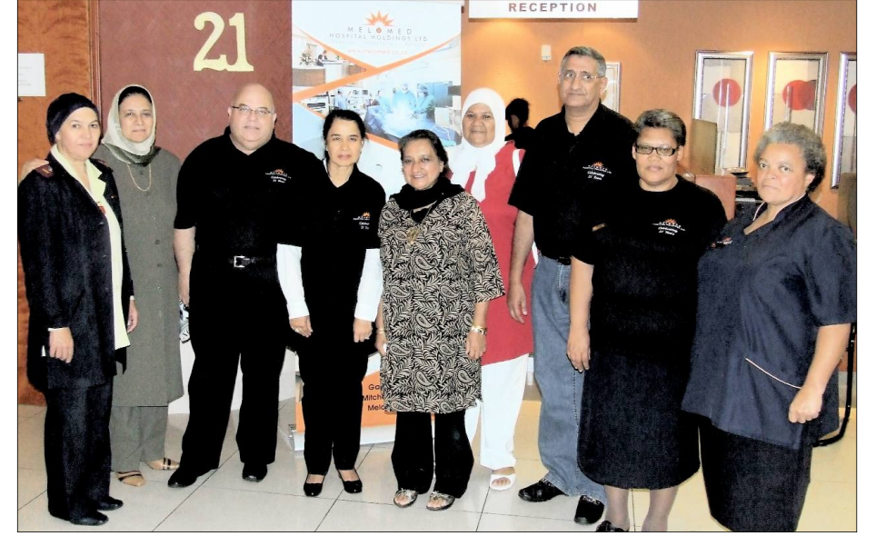
QUALITY CARE: High standard of quality care, combined with staff determination helps Melomed respond to the specific needs of clients.

ENS congratulates you on your 1st birthday