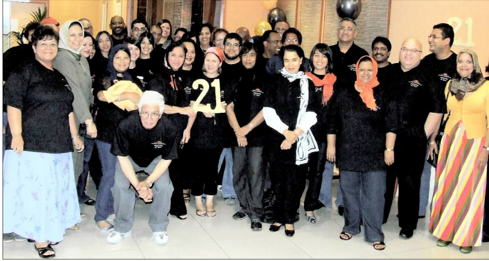
PROUD MOMENTS: Melomed takes pride in providing healthcare of an exceptionally high standard to the people of the Western Cape at its three hospitals – located in Bellville, Gatesville and Mitchells Plain.