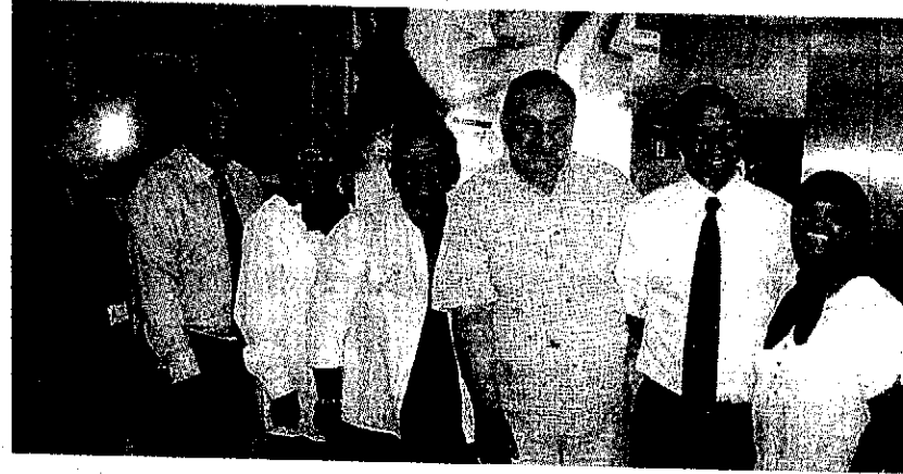
TEAM EFFORT: Staff and patrons at the World Kidney Day screenings.

"This is a sad situation as there is not sufficient capital in the government health sector to treat patients with kidney failure," he says.